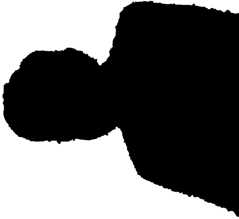
Senator Lisa Murkowski