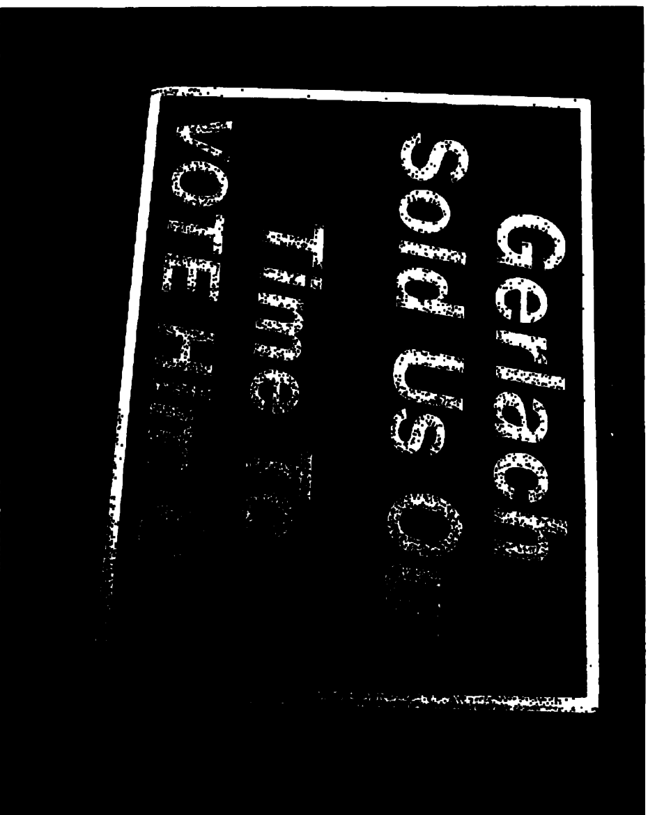
Lawn Signs Attacking Jim Gerlach along Route 100 near Ludwig's Corner— Without a Disclaimer