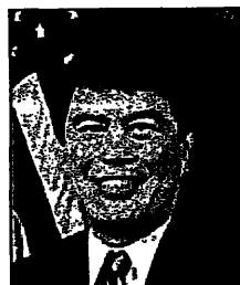
U.S. Rep. David Wu (D-OR)