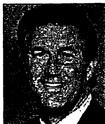
U.S. Rep. Rick Renzi (R-AZ)

The U.S. representatives listed below are the primary targets of our educational campaigns this year. Each of these members of Congress voted to send cancer, AIDS, and multiple sclerosis patients to federal prison for the simple crime of taking their medicine.