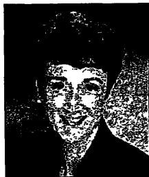
U.S. Rep. Heather Wilson (R-NM)

Incumbent Heather Wilson 55%; Challenger Richard Romero (D) 45%