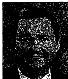
U.S. Rep. Clay Shaw (R-FL)

This action concluded on September 7, 2004, when Rep. Franks defeated his opponent in the Republican primary.