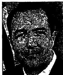
U.S. Rep. Trent Franks (R-AZ)

This action concluded on September 7, 2004, when Rep. Franks defeated his opponent in the Republican primary.