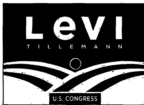
Current Committee logo

7 It appears that Tillemann also posted videos with similar content and the "U.S. Congress" logo to 8 his personal YouTube page. 29 Two of these videos, posted on June 9, 2017, included a link to