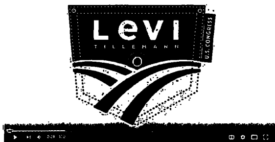
Testing the waters logo