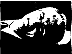
Governor Bob Holden DEMOCRAT

Step up to the plate and vote for the entire Freedom team of qualified, genuine leaders.